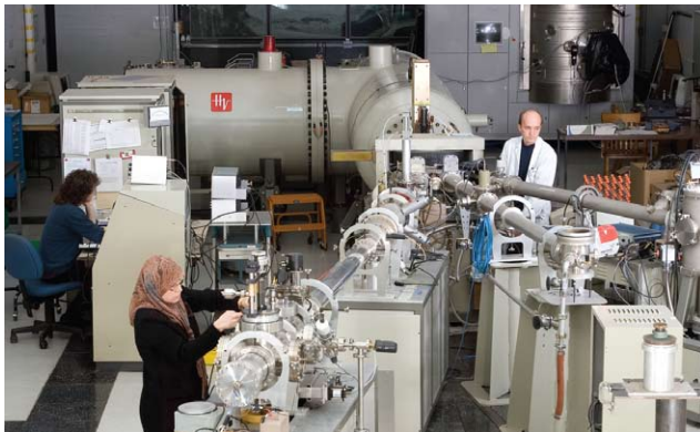
Photo of the GCM RBS setup. This technique has been used by the GCM for the past thirty years.

One may easily understand that RBS is very useful for making depth profiles up to 2 microns . In addition, RBS can quantify the elements present without the use of standards, which constitutes a significant advantage compared to other methods, such as secondary ion spectroscopy (SIMS). The detection limit of RBS varies between 0.001% and 10%, depending on the element analyzed and the composition of the thin film. RBS has earned a place in the hearts of scientists working in the field of semiconductor, for the analysis of silicon, InGaAs, InP, etc.